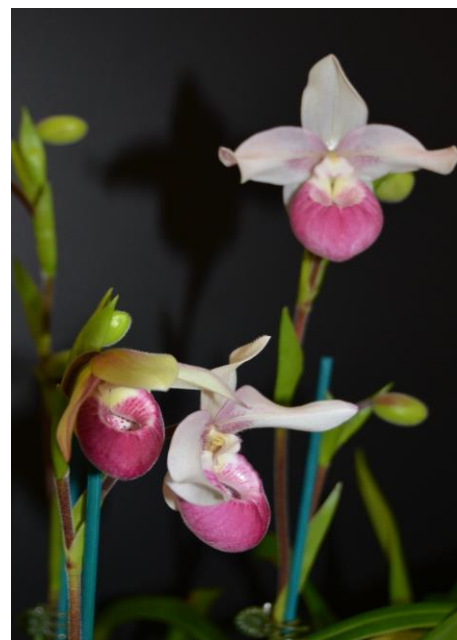
Phrag. Cardinale 'evergreen' – Hybrid Phrg Sedeni x Phrag Schlimi White with pink/rose red flower Intermediate grower, keep moist Benched by Joe Crawford