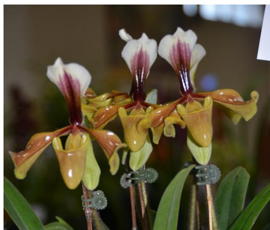
Winter Show Grand Champion

Reserve Champion Paph. Villosum Var 'annamense' Species Open Grower: Jason Khoo Grows cold, under Shade Flowers autumn, keep moist