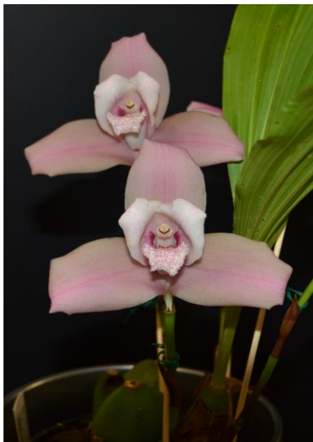
Lyc. Auburn x Lyc Alwine Miller - Hybrid Not registered, Pink flower 1 per spike Grow in unheated glasshouse or under shade. Keep water up during active growth. Benched by Alf Magnano