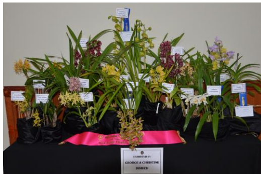
Best Large Display By: G & C Dimech