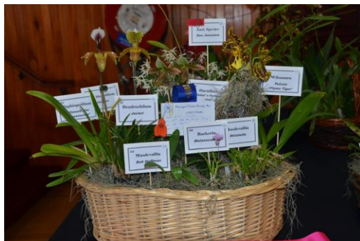
Best Basket of Orchids By: G & C Dimech