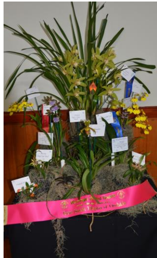
Best Small Display By: S & H Randall