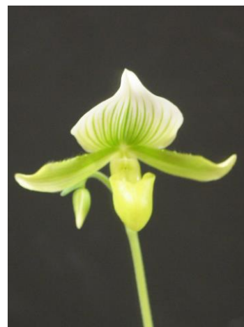
Best in Section - Open

The next Committee meeting will be at 7.30pm on Wednesday 2 nd . October, at the Bellfield Community hall.