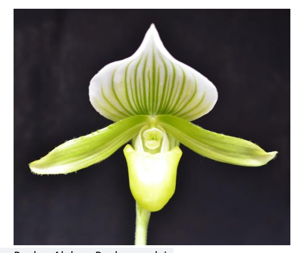
Paph. - Aloha x Paph. maudaie