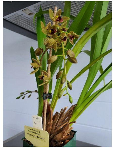
Cym. – Cricket x Canaliculatum 'Little Beauty' Grown by Kerri Ridgway (First time flowering)