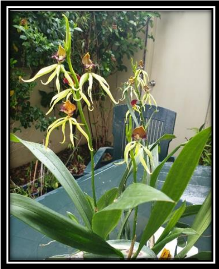
Epidendrum cochleatum Grown by M. Bisri & B. O'Reilly