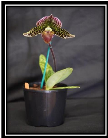
Paph. Destiny x Night Watch Grown by M. Coker