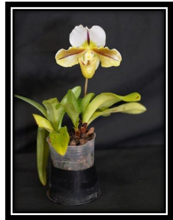
Paph. Unknown Grown by K. Ridgway