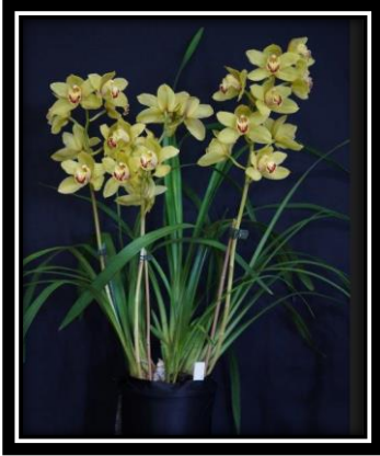
Cym. One Tree Hill 'Soltice Gold' Grown by M. Grzan