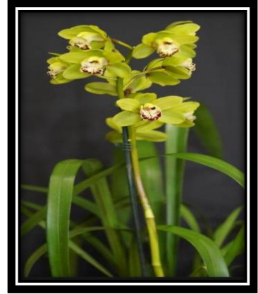
Cym. Gentle Touch 'Bon Bon' Grown by M. Grzan