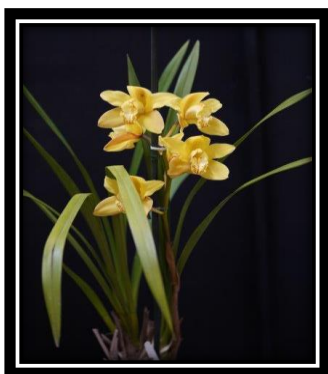
Cym. Unknown Grown by B. Duggan