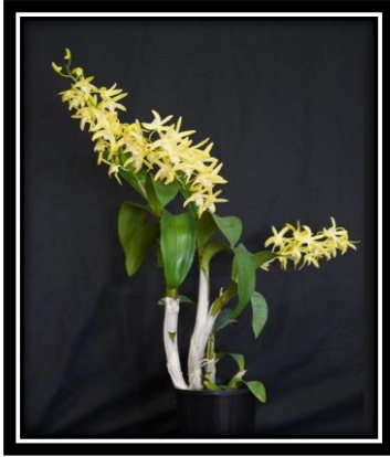
Den. Greta Snow Grown by N. Truong

Reserve Champion Orchid Champion Aust. Native Best Aust. Native - Open