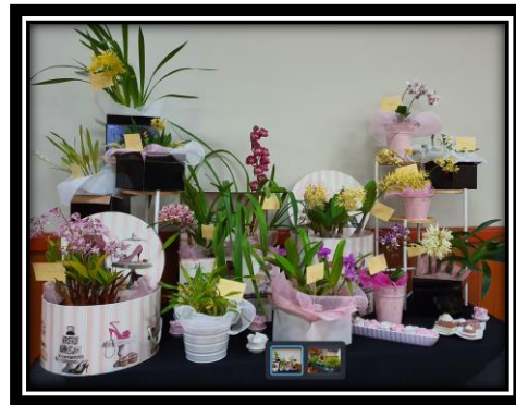
a little colour