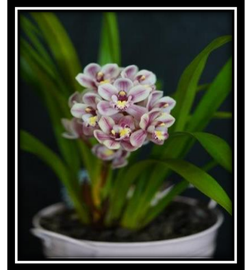
Cym. Little Sarah 'Princess' Grown by M. Bastecky