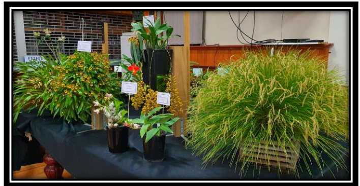
& more yellow