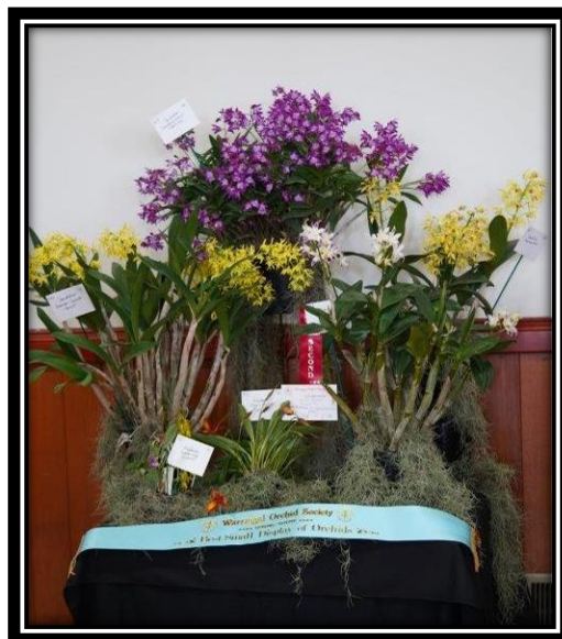
Displayed by S & M Randall