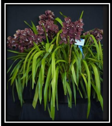
Cym. Khan Flame 'Tuscany' Grown by L. Balazinec