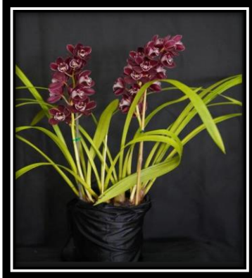
Cym. Willunga Regal 'Midnight' Grown by G & C Dimech