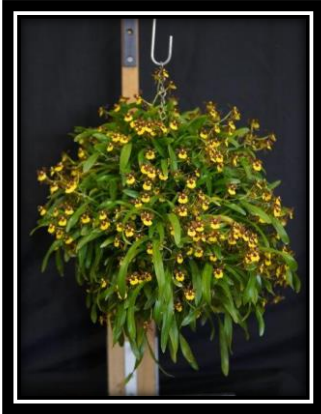
Oncidium Croesus Grown by M. Coker

Grand Champion Orchid Champion Species Orchid