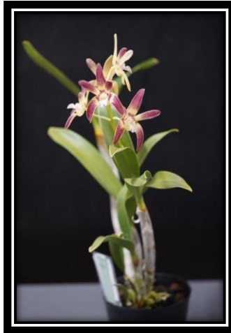
Dendrobium Eclipse 'Rosewitha' Grown by A. Rogers