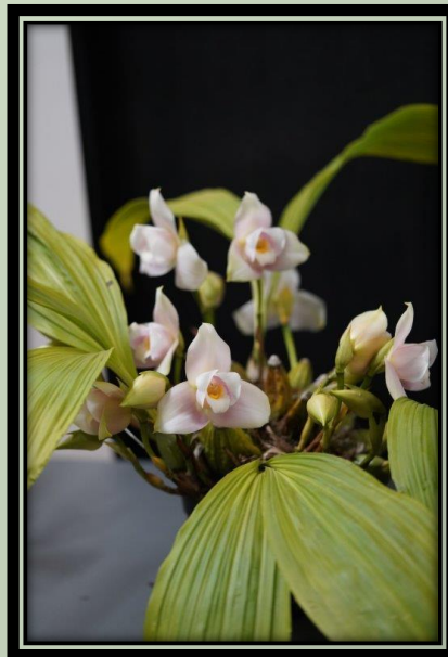
Lycaste Macama 'aline'