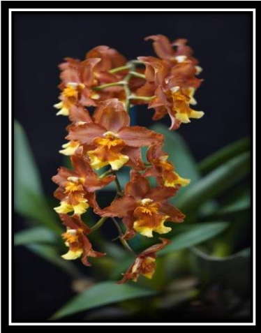
Oncidium Hilda Plum tree Grown by M. Coker