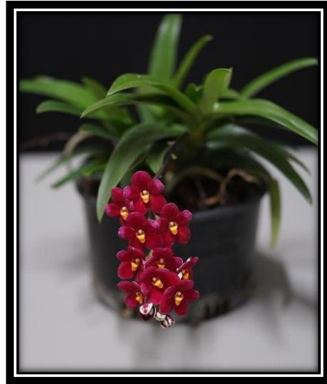
Sarc. Voo Doo x Elegance 'Super Pink' Grown by S. Pantelejenko