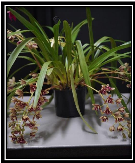
Cym. Spark Sprite 'Sparky' Grown by M. Schembri