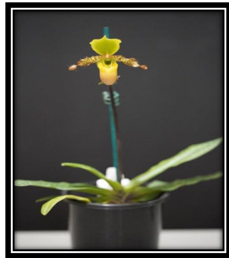
Paph. Primulinum x Purpurslens Grown by K. Lam

Extra help needed this month to set-up for Xmas dinner.