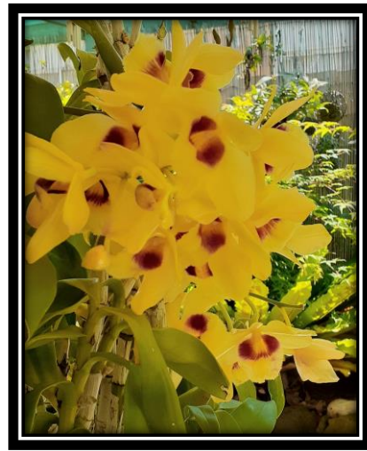
Dendrobium Gatton Sunray