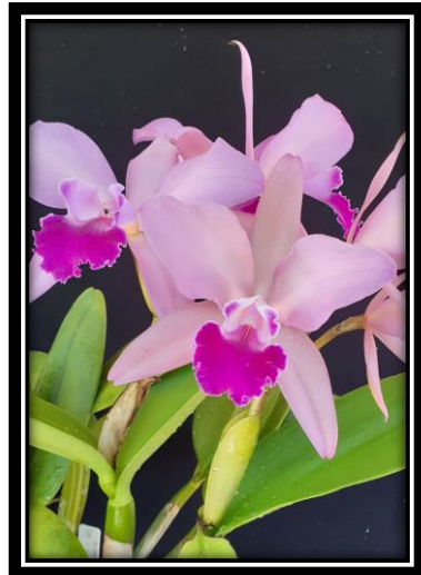
Cattleya little leopard

Please send me your favourite orchids in flower so we can all appreciate them.