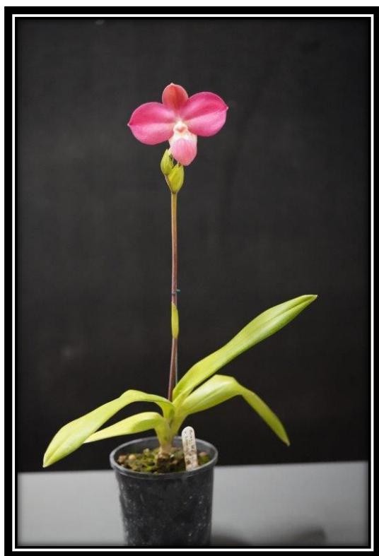
Phrag. Bessaea x Kovachii