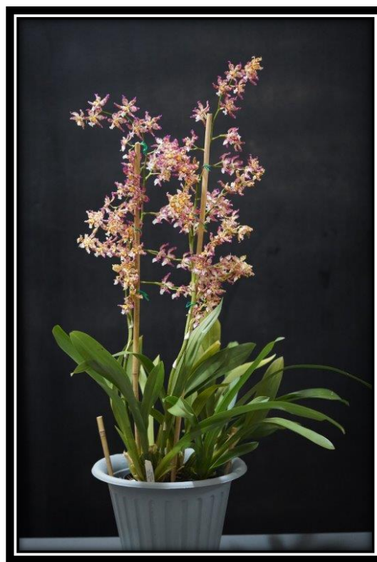
Pacific Panache