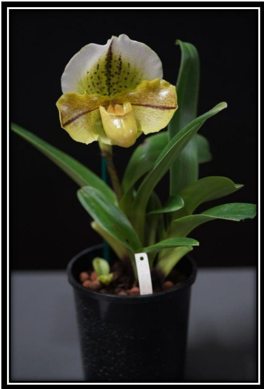
Paphiopedilum Neridah x Village Green Grown by M. Coker