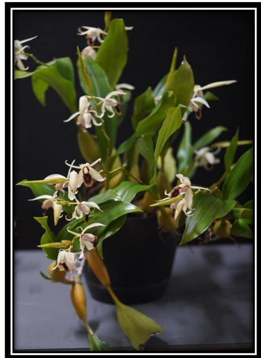
Coelogyne ovalis x barbatum Grown by K. Sloan