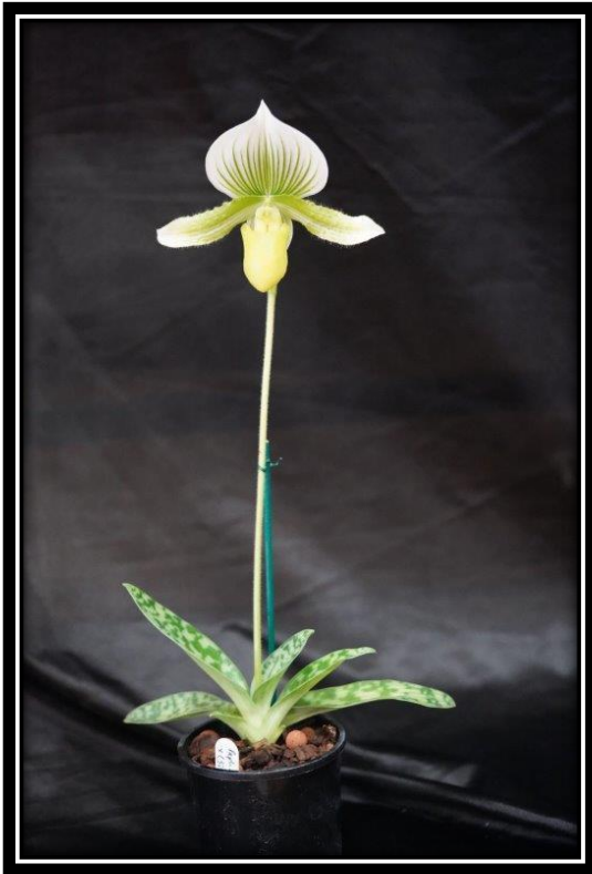
In-Charm Silverbell x In-Charm Silver Jewel Grown by M Coker