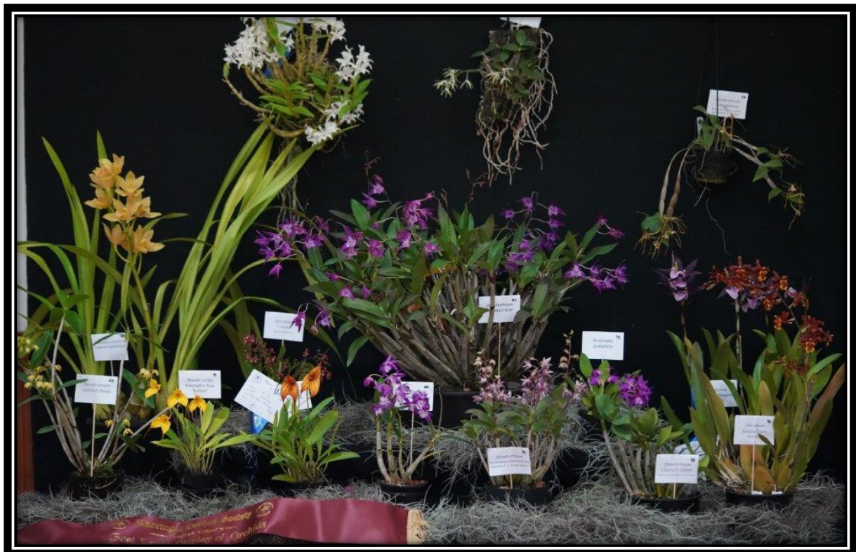
Grown by A Rogers