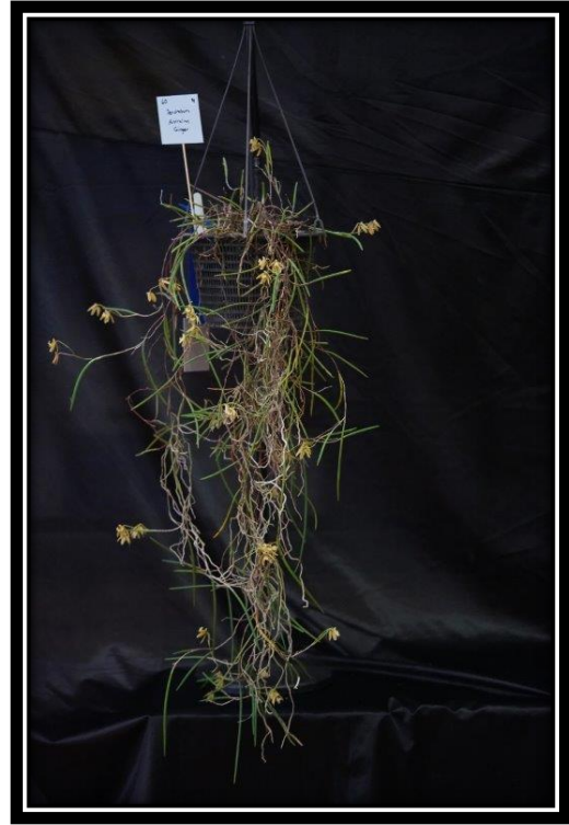
Dendrobium Australia Ginger Grown by N Gaskett