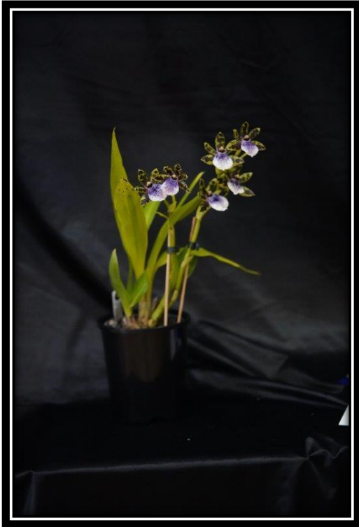
Zygonesia Zest 'Tyabb Emerald' Grown by M Volodina