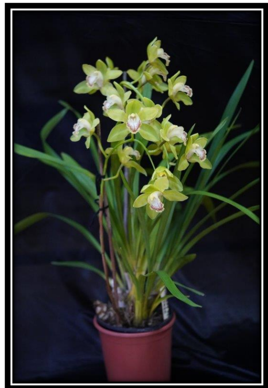
Cym - Kimberley Valley 'Jade' Grown by S Grzanic