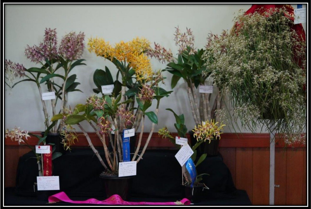
Grown by M & N Truong