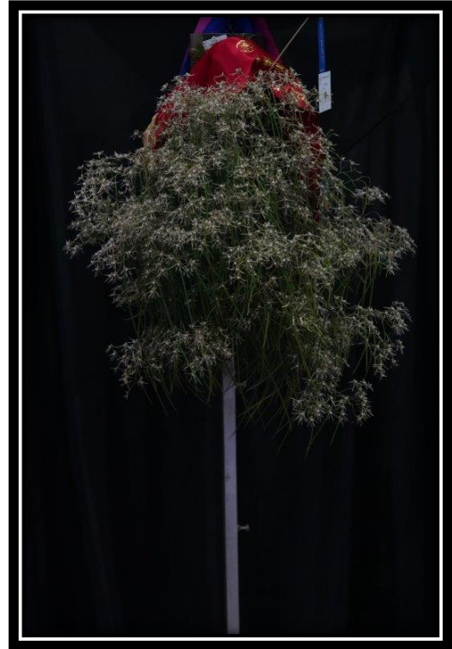
Dendrobium Tania Grown by M & N Truong

Reserve Champion Champion Australian Native Champion Specimen Best Aust Native - Open