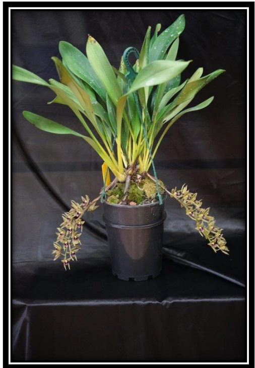
Cymbidium devonianum Grown by M Coker