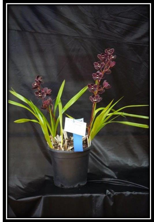
Cymbidium Warringah Winter 'National Show' Grown by K Ridgway