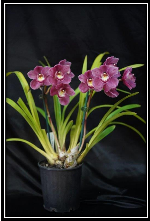
Cymbidium Valley Olympic 'Rose' Grown by M Volodina