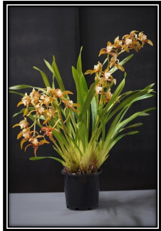
Cym tracyanum Grown by K. Sloane