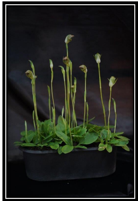
Pterostylis curta Grown by K Sloane