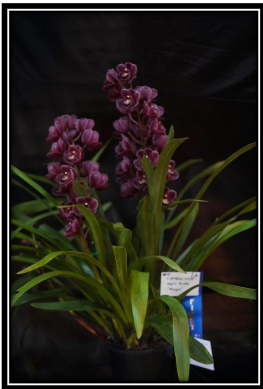
Cym - Nats Pride 'Magic' Grown by D Wain