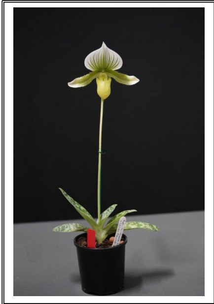
Paph. In Charm Silver Bell x Silver Jewel Grown by M Coker