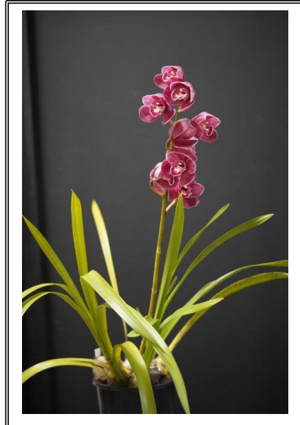
Cym. Alexander Flame x Flaming Vulcan Grown by K Sloane