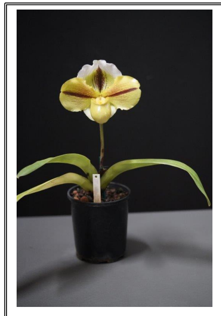
Paph. Glural Passport x Magiloro Grown by M Coker