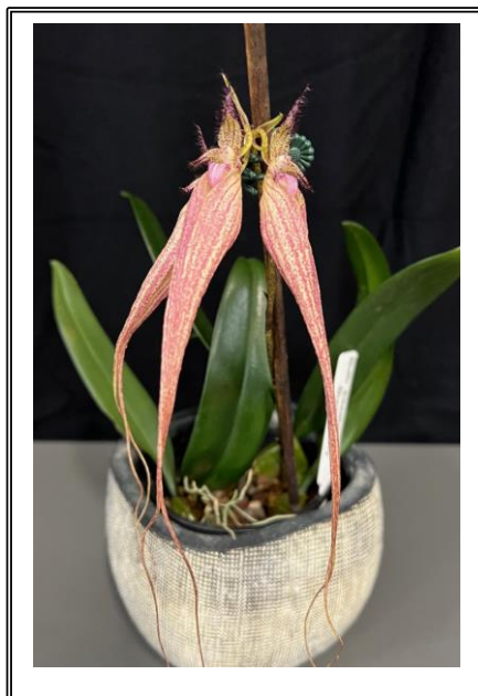
Bulb. Elizabeth Anne