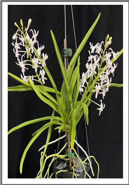
Vandachostylis Lou Sneary