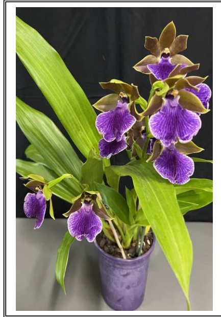
Zygo. Artur Elle Essendon