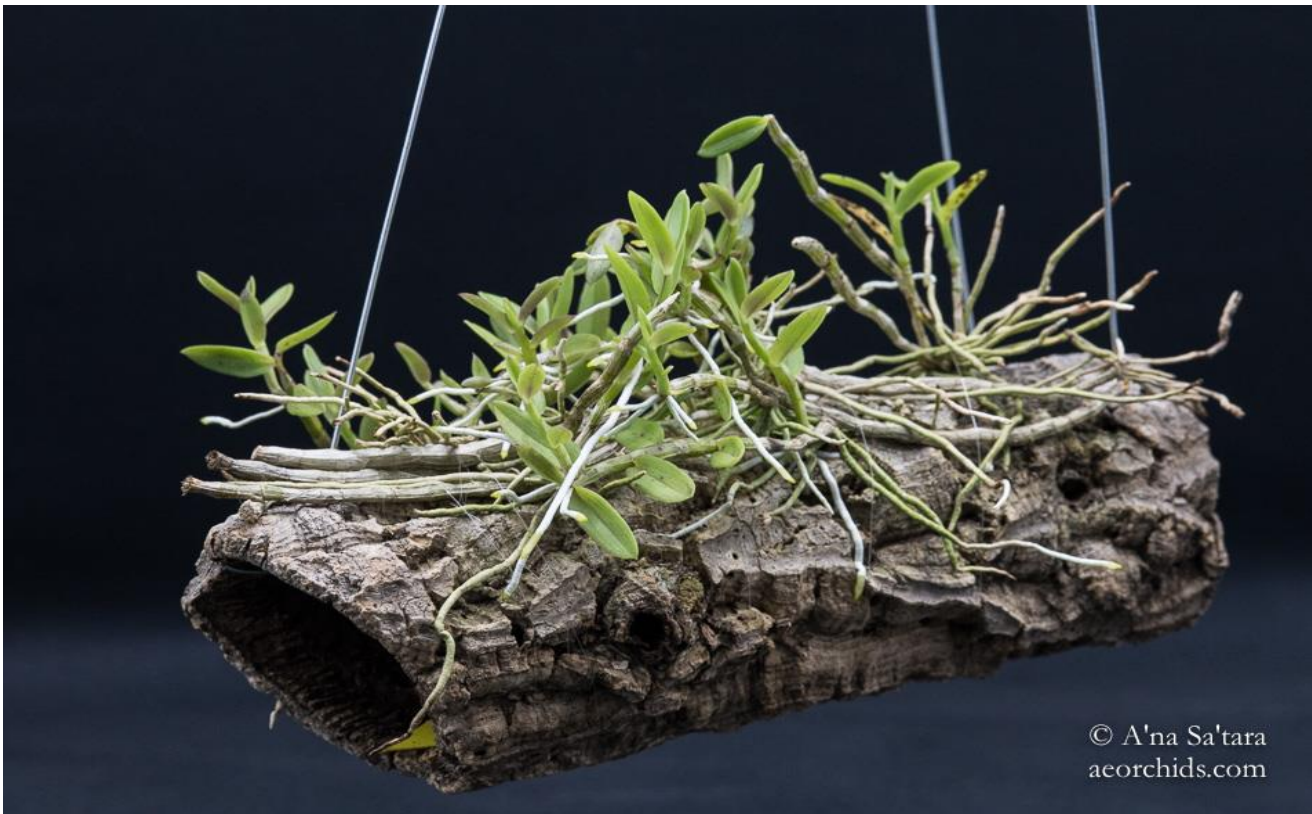
Dendrobium loddigesii . After a few months of growth: early August 2020.