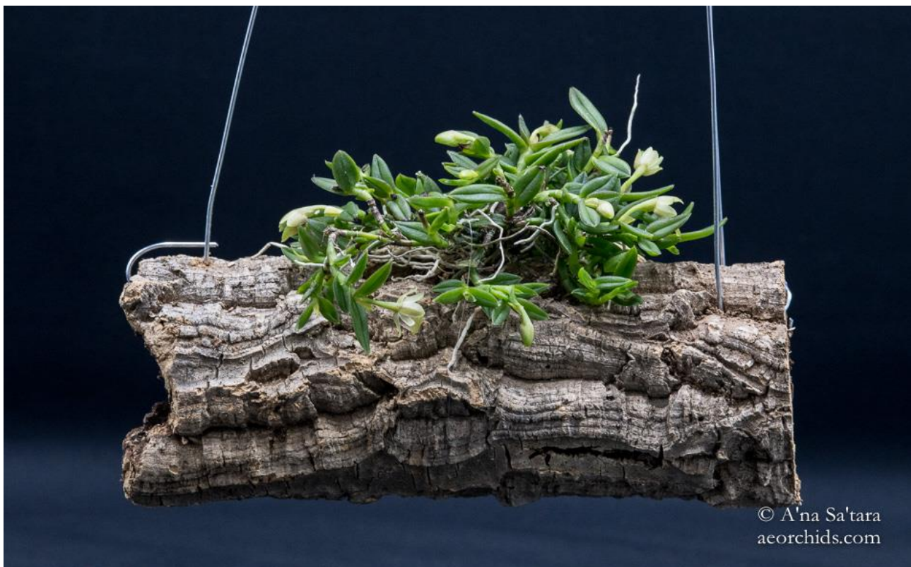
Epidendrum maxthompsonianum . Immediately after mounting in April 2020. Epidendrum