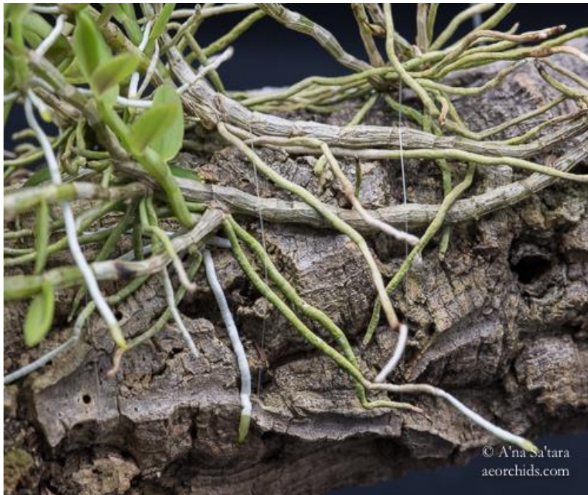
Dendrobium loddigesii . New roots expanding over the log after three months.

We have also created “logs” by hanging cork pieces or slabs horizontally using a standard metal basket hanger attached in three places. For one thick slab of cypress bark, we added picture hanging hooks at the ends to attach the wire. In other cases, we just drilled through the cork and inserted the wire through it. Horizontal mounts have worked exceptionally well for Dendrobium kingianum . Our horizontal slabs have far outgrown the vertical mounts. Other Australian Dendrobium have also done very well mounted horizontally, particularly Dendrobium (Dockrillia) wasselli and Dendrobium prenticei .