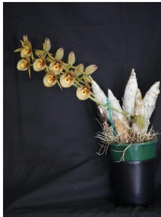
Catasetum Black Magic 'Jem' M Coker

Pterostylus curta (the blunt greenhood) is widespread and common in Queensland, New South Wales, Victoria and Tasmania, growing in moist places in heath, scrub, woodland and forest. It also occurs on Lord Howe Island and in New Caledonia but is rare in South Australia. (from Atlas of Living Australia )