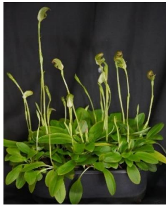
Pterostylus Curta K Sloane

Pterostylus curta (the blunt greenhood) is widespread and common in Queensland, New South Wales, Victoria and Tasmania, growing in moist places in heath, scrub, woodland and forest. It also occurs on Lord Howe Island and in New Caledonia but is rare in South Australia. (from Atlas of Living Australia )