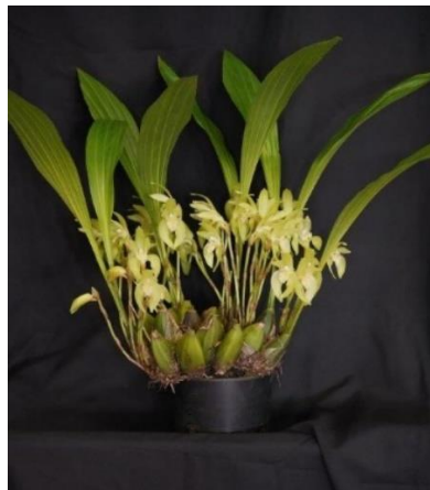
Sudamerlycaste Fimbriata M. Coker

Sudamerlycaste fimbriata - A medium sized, cold to warm growing epiphytic or lithophytic species, found in Colombia, Peru, Bolivia and Ecuador at elevations of 1000 to 2800 meters under scrub in rocky soil with shady conditions and in river canyons and on decaying tree stumps. (from International Orchid Foundation )