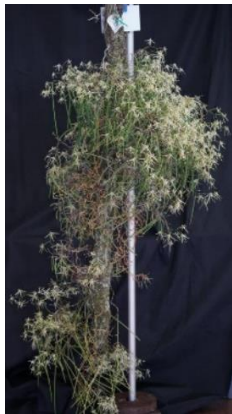
Den. Teretifolium A & L Shepherd