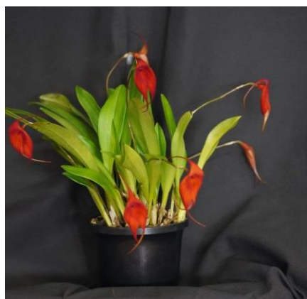
Masd. Unknown A La Rocca