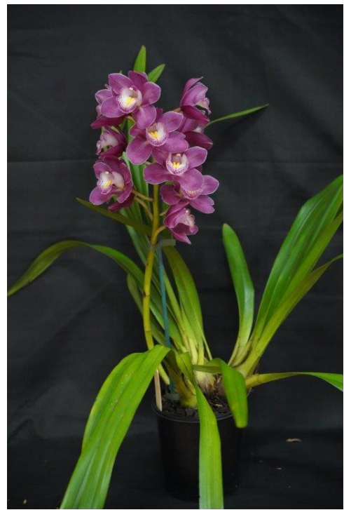
Cym. Valley Olympic G Browning