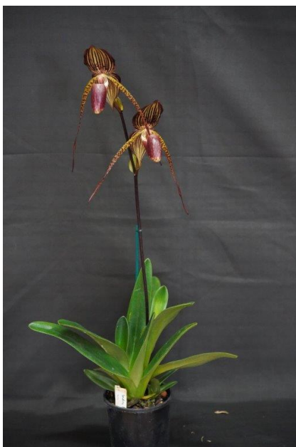
Paph. Hsinying 'Lady Duck' M Coker