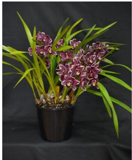
Cym. Winter Fire 'Frosty Tips' I Katis