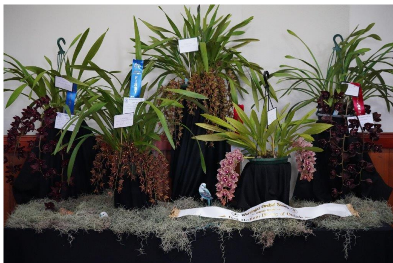
Best Medium Display of Orchids F&J Spiteri