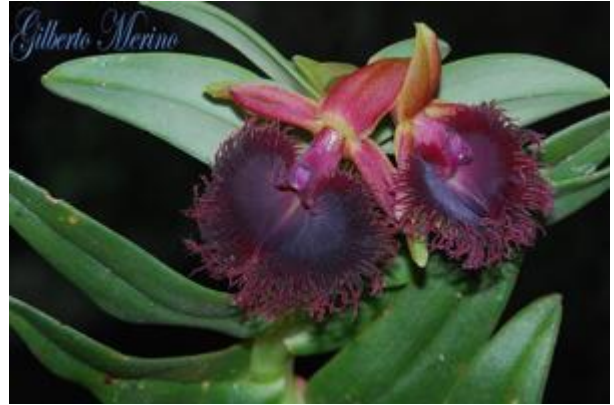
A close-up of the flower from the same website.

Epidendrum Medusae (also known as Nanodes medusae ) is a medium sized, epiphytic, cool growing orchid from the wet montane cloud forests of Ecuador (elevations of 1800 to 2700 meters). It has short rhizomes giving rise to clustered, cane-like, laterally compressed, pendant stems that are basally branching, and completely enveloped by compressed, conduplicate, fleshy, gray-green, foliaceous sheaths carrying coriaceous, narrowly oblong-ovate, apically unequally bilobed, basally clasping leaves that are somewhat twisted at the base.