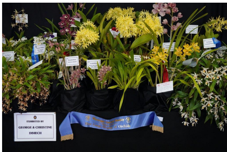
Best Large Display of Orchids G&C Dimech