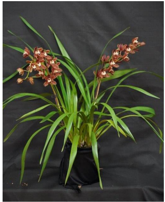
Cym. Mini Sacramento M Grzan