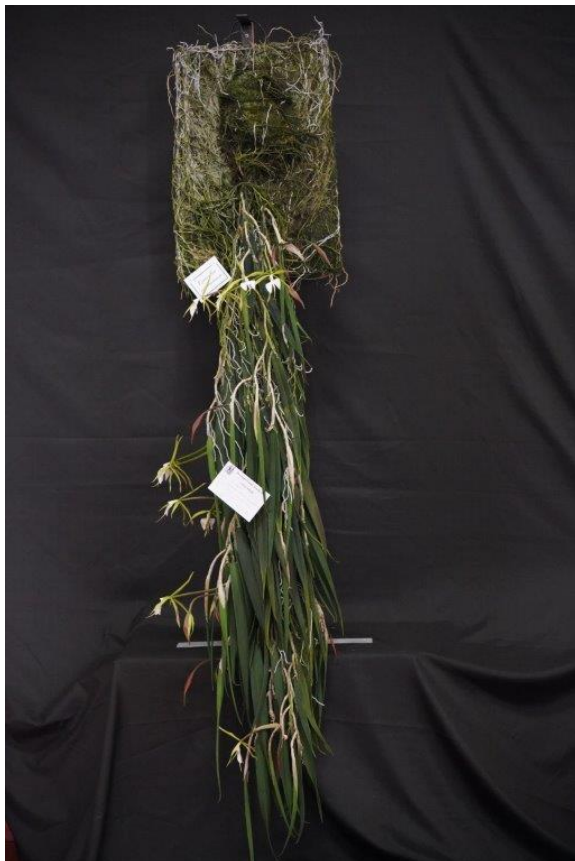
Epi. Parkinsonianum M. Coker

This large sized, cool to cold, pendant growing, epiphytic species is found in Mexico, Guatemala, Belize, Honduras, El