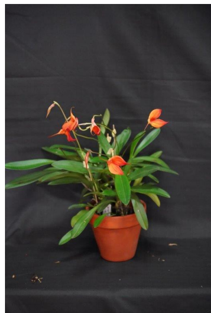
Masd. Heathii 'Golden Gate'