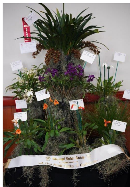
Best Small Display of Orchids S&H Randall