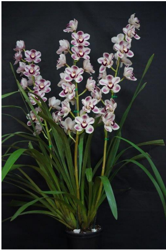
Cym. Kimberley Splash 'Tee Pee' (Also Best Large Cymbidium – Open) Grown by J. Guario

Cymbidium Kimberley Splash is an orchid hybrid originated by Kimberley Orch. in 2002. It is a cross of Cym. Khan Flame x Cym. Valley Splash.